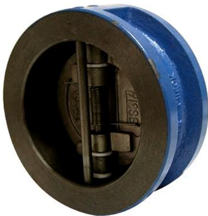
Ref. GENE BRE: 2401