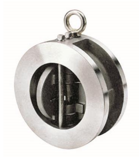
Ref. GENE BRE: 2402